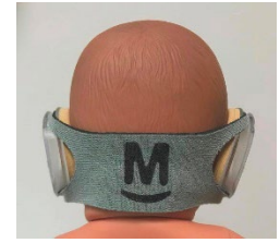
Note: Foam seal color may be tan or black.

4. Secure the headband around the head, as follows: